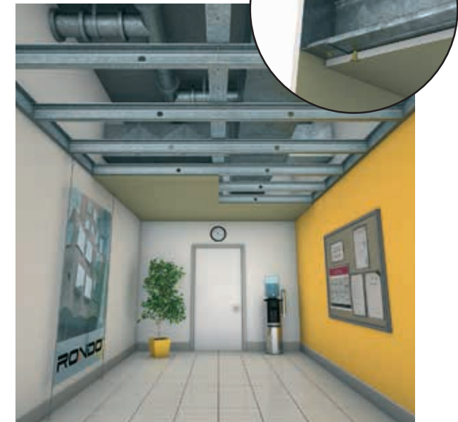
Using Steel Stud & Track

Closing up the stud spacings, boxing studs, using a thicker gauge or a bigger stud, if space allows, will provide many different permutations to achieve your requirements.