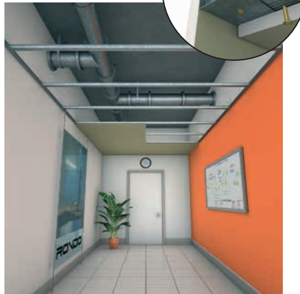
Using 155 Furring Channel

Just remember to use Rondo 140 wall track to secure the Furring Channel to the opposing walls.