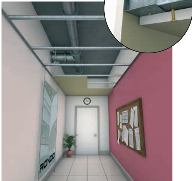
Using 129 Furring Channel

With the depth of the Furring Channel only being a nominal 30mm, there is little chance of not having enough clearance for services.